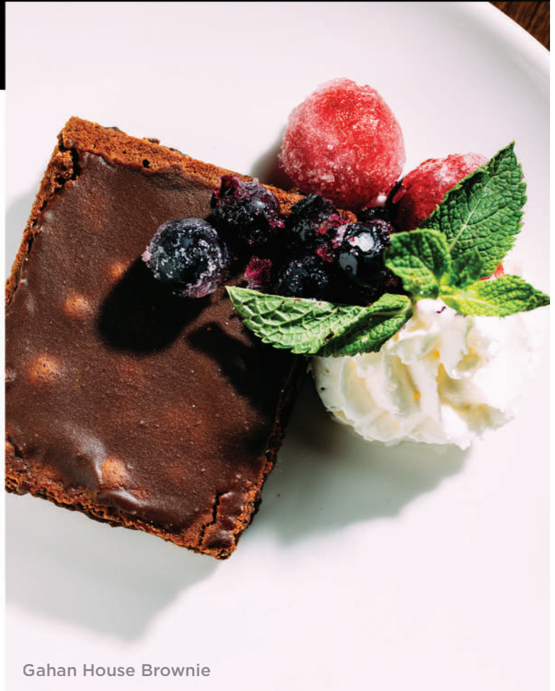
Gahan House Brownie

Our team would be more than happy to work with you to create a custom menu.